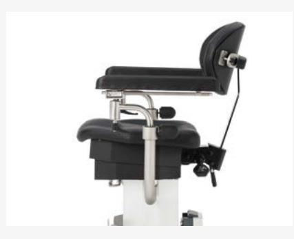
Multi articulated armrests shifting: bwd