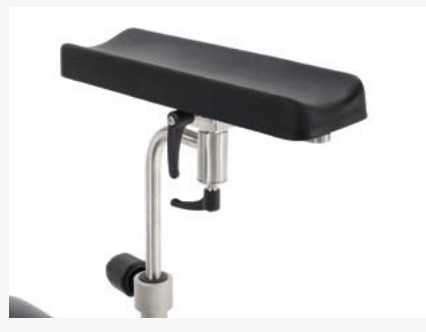
Multi articulated armrest