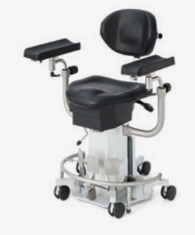
Anatomical seat cushion