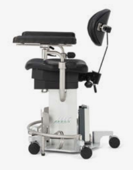
Seat and backrest tilt