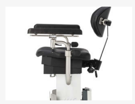
Seat tilt: up