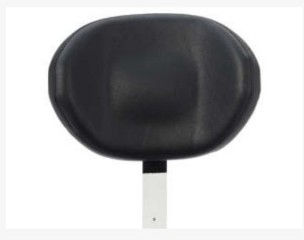
Backrest with lumbar support

The ak480 surgeon's chair can be ordered with standard armrests, standard backrest and fixed seat holder. Mind the reduced functionality when placing the order.