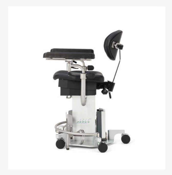
Seat tilt and backrest tilt