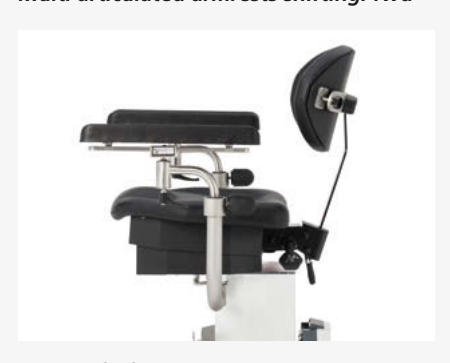
Seat shift: fwd