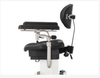
Seat tilt: down