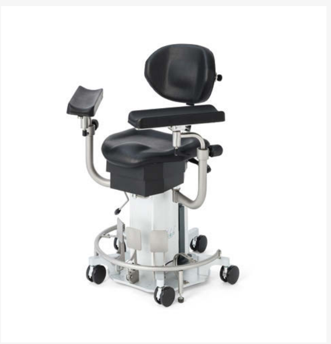
Armrest swivel: out