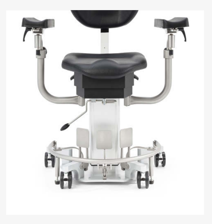
Heal controls: seat up, roller fixing, seat down