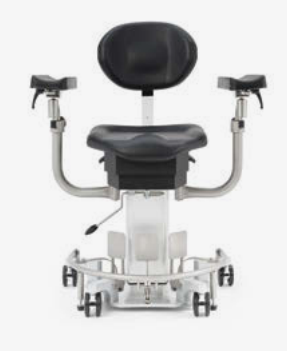
Moveable armrest holder