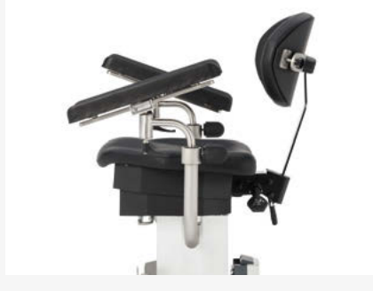
Multi articulated armrests tilting