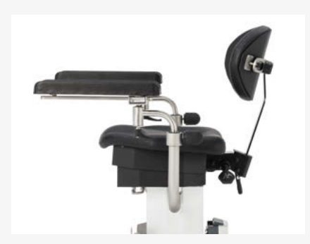
Multi articulated armrests shifting: fwd