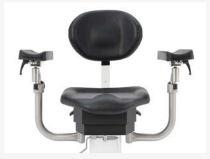
Anatomical seat cushion