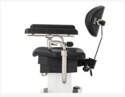
Seat shift: bwd