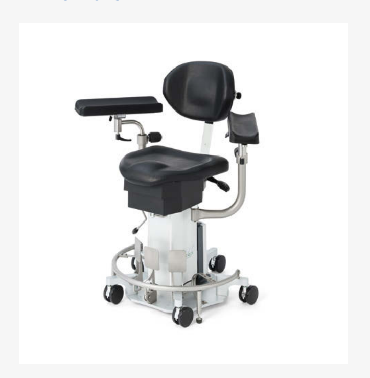
Armrests swivel: in