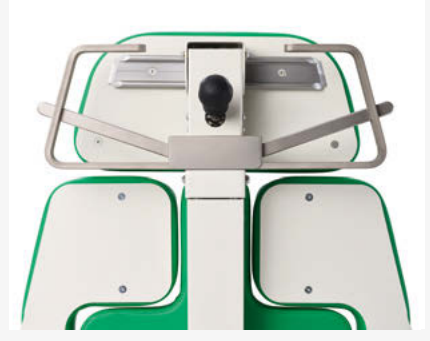
Backrest adjustment lever and sliding headrest