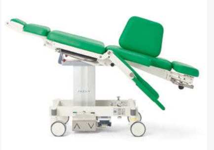
Trendelenburg position is available in just seconds