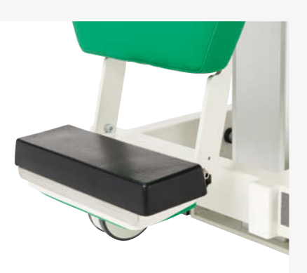
Adapter foot support